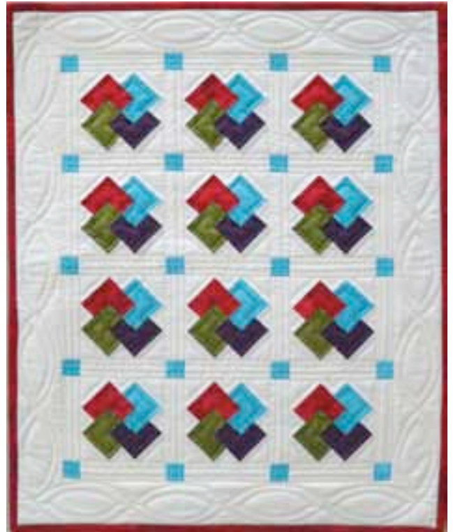
Finished size 22" x 27" 4 \frac{1}{2} " Finished Blocks