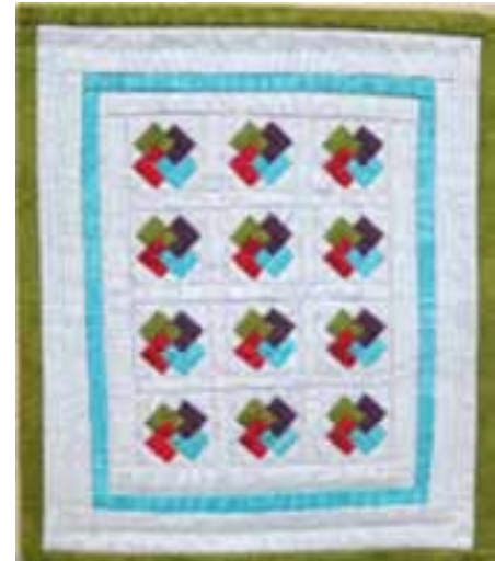
Finished size 8" x 9" 1 ¼" Finished Blocks