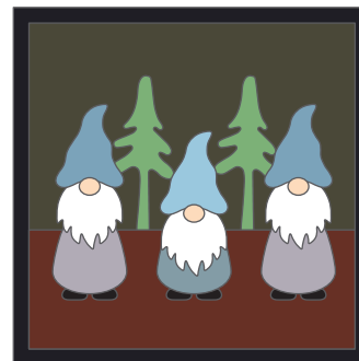
Create a Gnome Sweet Gnome wall hanging.